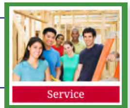
MISSION POSSIBILITIES ARE AVAILABLE THROUGH THIS LINK ON THE HOMEPAGE.